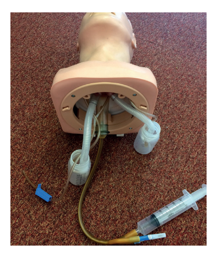
FIGURE 2. Experimental setup of the manikin

tomical characteristics of the manikin upper airways concluded that this manikin is appropriate for use as a patient simulator for a pulmonary aspiration model. The distance between the corner of the mouth and the carina is 26 cm and the angles between a vertical line and the right and the left bronchus are 25° and 45°, respectively, similarly to adult humans.